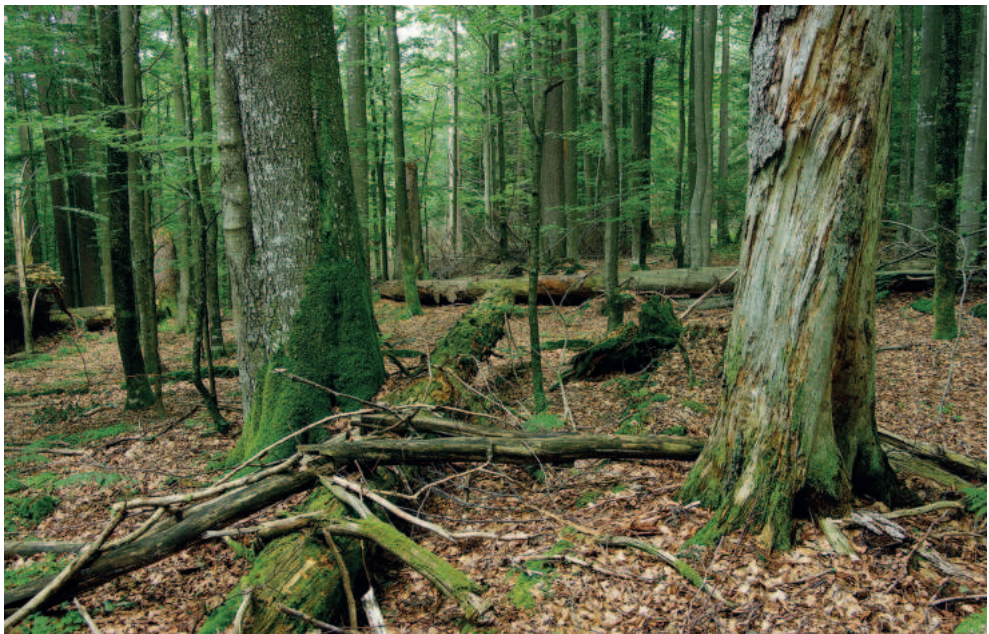
Fig. 2. Interior of Zámecký les forest, a typical mixed montane forest composed of Fagus sylvatica , Picea abies and Abies alba .

Czechia, Šumava National Park (NP), 1.6 km S of the village of Železná Ruda, near former settlement Debrník (after former Debrník = Deffernik chateau), forest stand called „Zámecký les“ (Fig. 1); natural zone of the NP; elevation: 770–825 m a.s.l.; coordinates of the centre: 49.1230436N, 13.2352622E; area ± 8 ha; geomorphology: mostly flat terrain, slightly inclined towards the southwest, divided only by a notch of a stream on the northwestern border and several smaller streams in the southern part; geological background: Proterozoic to Paleozoic