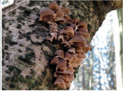
Fig. 4. Cyphella digitalis (PRM 956951), fallen trunk of Abies alba , on branch sticking out into the air. Critically endangered species in Czechia (ZÍBAROVÁ et al. 2024).