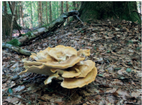
Fig. 8. Bondarzewia mesenterica , parasite on roots of Abies alba . Near threatened species in Czechia (ZÍBAROVÁ et al. 2024).