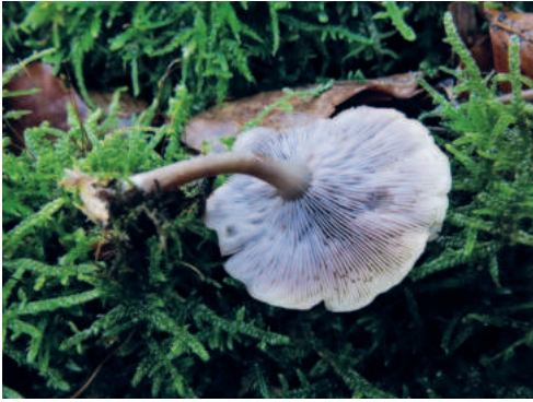
Fig. 3. Baeospora myriadophylla (PRM 957179) on fallen decaying trunk of Picea abies . Critically endangered species in Czechia (ZÍBAROVÁ et al. 2024).