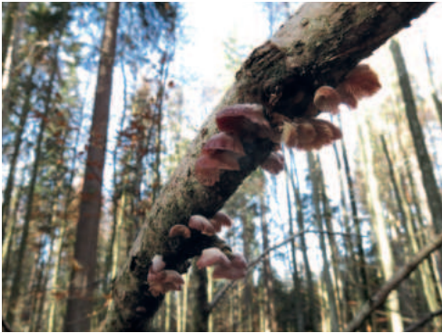
Fig. 5. Panellus violaceofulvus , fallen trunk of Abies alba , on branch sticking out into the air. Endangered species in Czechia (ZÍBAROVÁ et al. 2024).