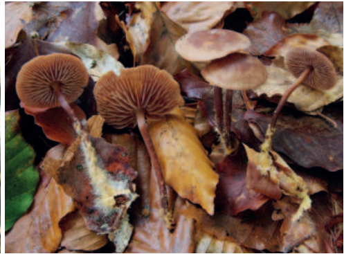
Fig. 6. Gymnopus fagiphilus (PRM 957155) in fallen leaves of Fagus sylvatica . Vulnerable species in Czechia (ZÍBAROVÁ et al. 2024).