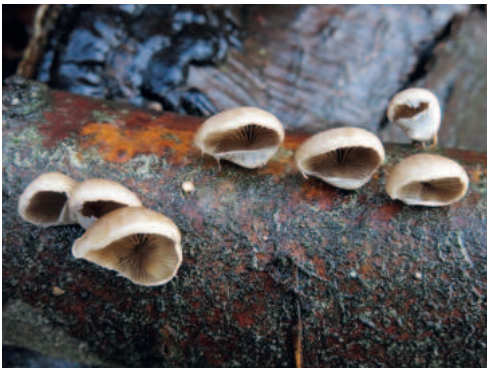
Fig. 7. Tectella patellaris (PRM 959047) on fallen branch of Fagus sylvatica . Vulnerable species in Czechia (ZÍBAROVÁ et al. 2024).