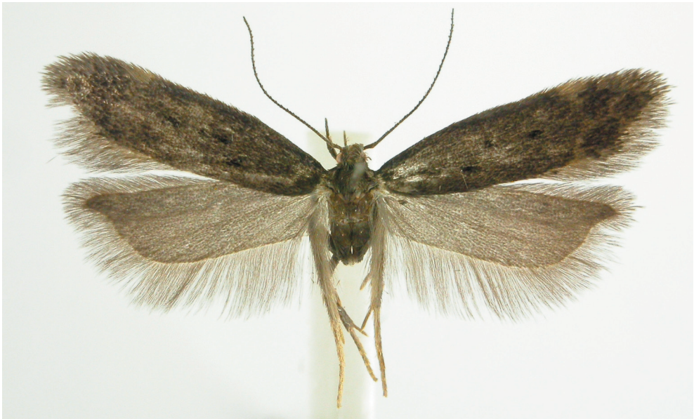
Fig. 3. Bryotropha boreella (Douglas, 1851), Blanice, 28 Jul 2008.

Bryotropha boreella (Douglas, 1851). 6: 28 Jul 2008, 1 spec. (♂, gen. prep.), (Fig. 3). One of the most remarkable and generally important records in the Blanice NNM. The species' core distribution area includes particularly North and Central Europe (outside the above area, it is known only from the United Kingdom and the Ural Mts.; KARSHOLT & RUTTEN 2005). In Central Europe, it is predominantly alpine (a disjunctive alpine-boreal distribution). In the Czech Republic, it was first reported from the Červené Blato peat bog in the Třeboň Basin (SPITZER & JAROŠ 1993). Nevertheless, there are records made by J. Liška at České Velenice in the 1980s (cf. ELSNER et al. 1999). In the latter study, the species occurrence was also confirmed in the Mrtvý Luh near the town of Volary. Until recently, the species was known only from peat bogs in southern Bohemia.