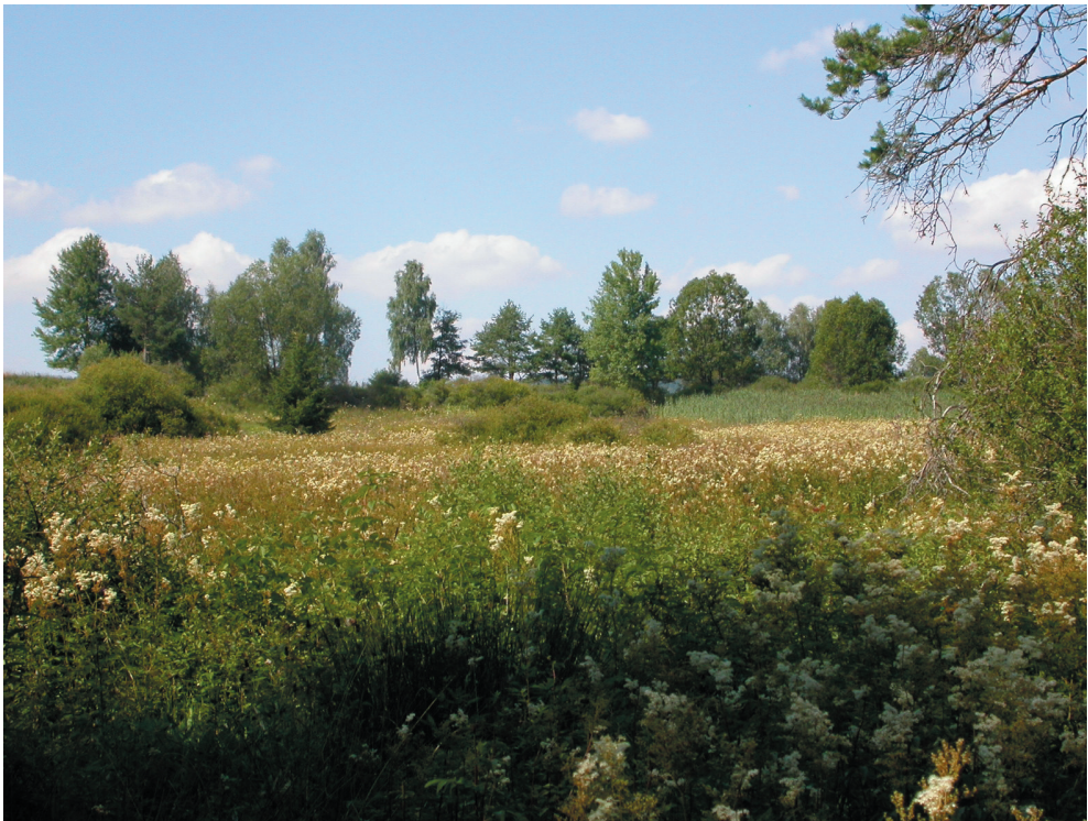
Fig. 2. Wet meadows at the Spálenec train station site, in the background on right the Reedbeds site.

At elevations above 1000 m, acidophilous mountain beech forests have also been preserved. The white butterbur ( Petasites albus ) growths predominate in this habitat. A more detailed description of natural conditions in the SPA presented MAŠKOVÁ et al. (2003), while a more detailed outline of vegetation at the individual sites published Pavlíčko (1997, 1999, 2000).